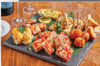
APERITIVO MILANO FOR 3-4 PAX

COMPLIMENTARY EXTRA VIRGIN OLIVE OIL, FRESH MADE BREAD & PARMESAN CHEESE